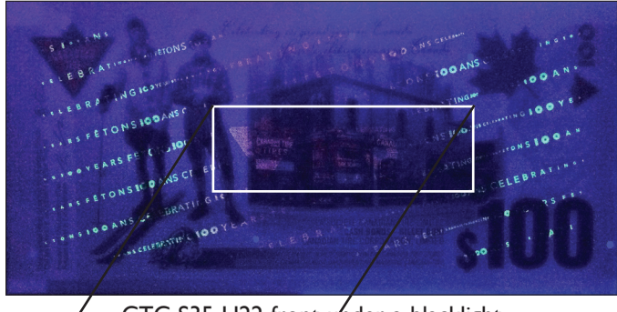
CTC S35-H22 front under a blacklight