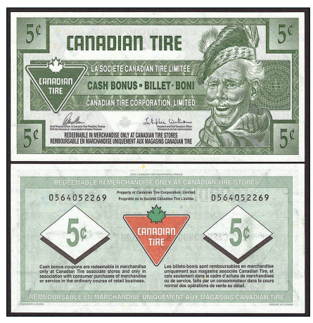
S32-B19-05 highest serial number