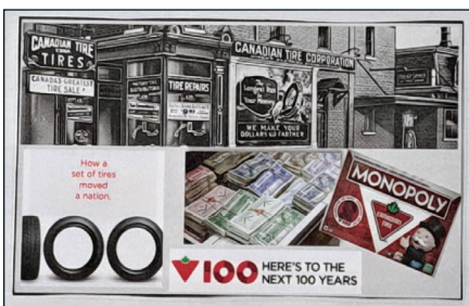
Someone put this small collage together. Probably images from internet that were laminated with a clear plastic. Rose Van Sickle showed it to the members at the ONA meeting.