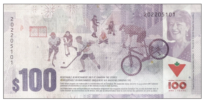
CTC S35-H22 back