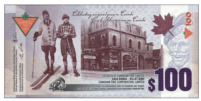
CTC S35-H22 front

by Jerome Fourre - CM0000120 - jerome4e@gmail.com