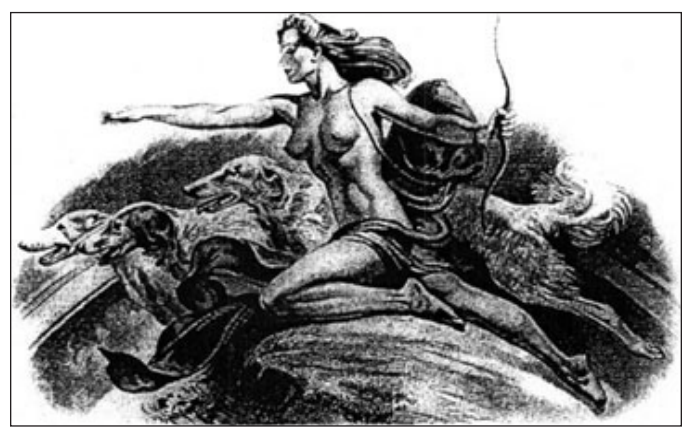
Figure 2: H.R Dawson's engraving "Diana and Hounds."