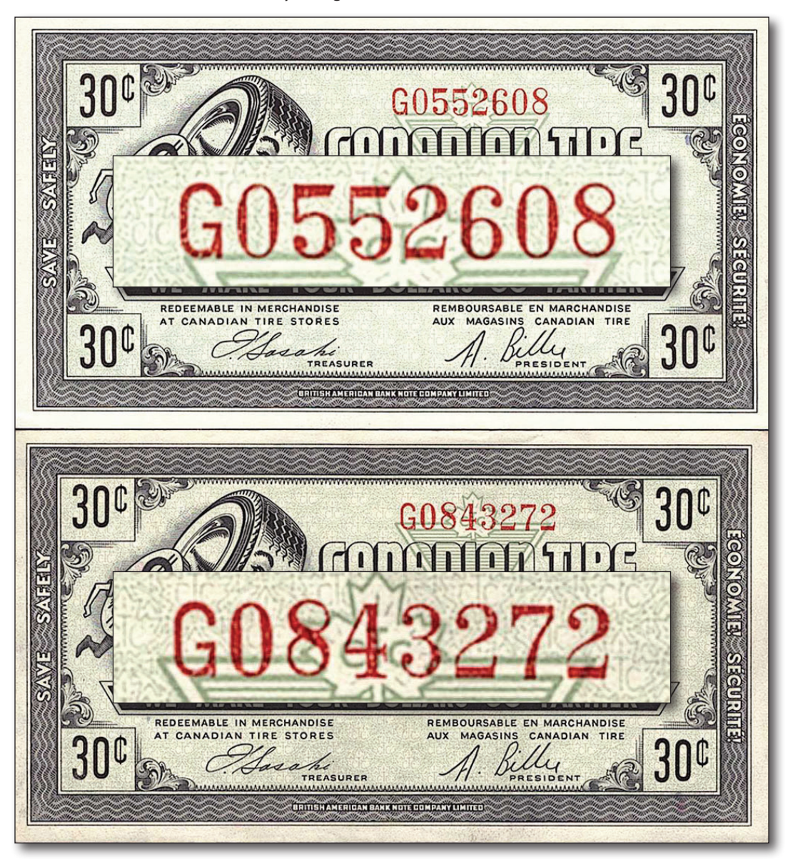
Two G07-F-G1 - "Thin" 30¢ notes

I recently acquired the top 30 \not \in note. When I was placing it with the other 30 \not \in note in my collection, I noticed that the entire serial number was a lot thinner than my original note.