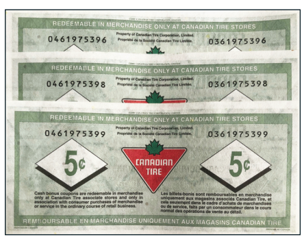
S30-B09-03 - with mismatched serial numbers Sent by Bill Cuff