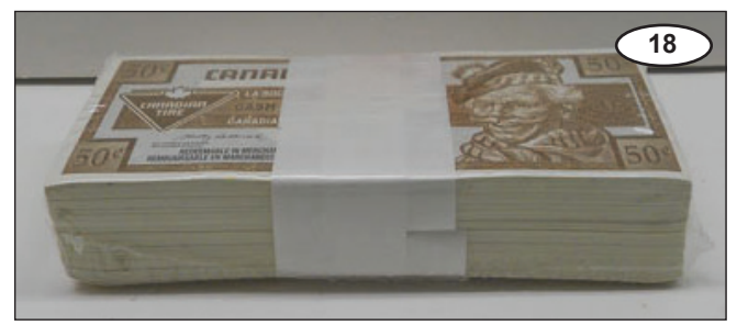
A bundle of CTC S27 50¢ notes with the white bands.