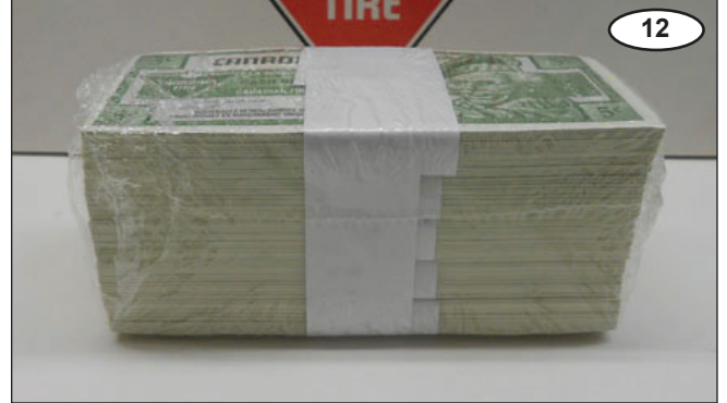
A bundle of CTC S27 5¢ notes with the white bands.