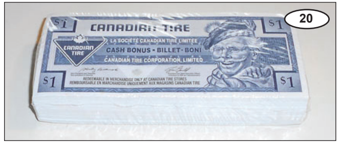
A bundle of CTC S28 $1.00 notes with the yellow separators.