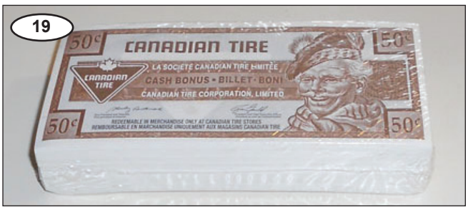
A bundle of CTC S28 50¢ notes with no white bands.