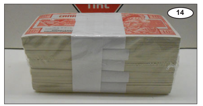
A bundle of CTC S27 10^{\circ} notes with the white bands.