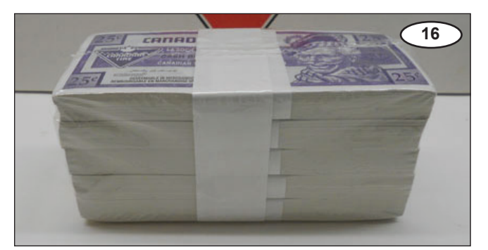
A bundle of CTC S27 25¢ notes with the white bands.