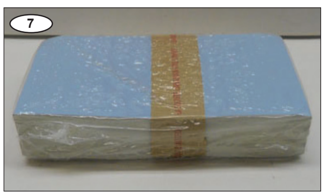
The same bundle of CTC S20 $1.00 notes showing the blue separators.