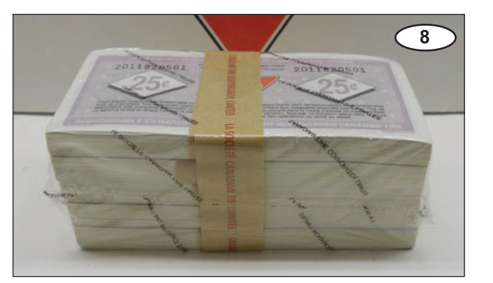
A bundle of CTC S24 25¢ notes.