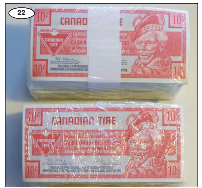
Two bundles of CTC S31 10¢ notes, one with the white bands and one without. Both with yellow separators.