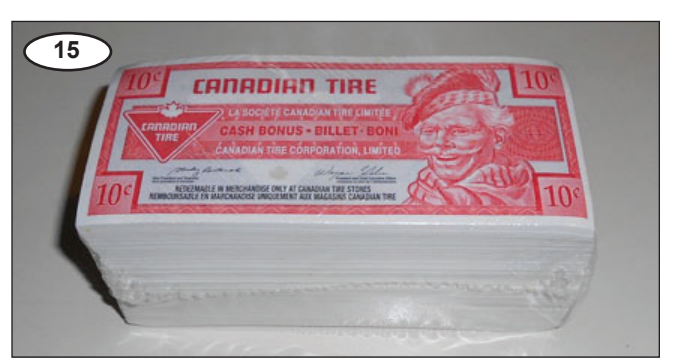
A bundle of CTC S27 10¢ notes with no white bands.