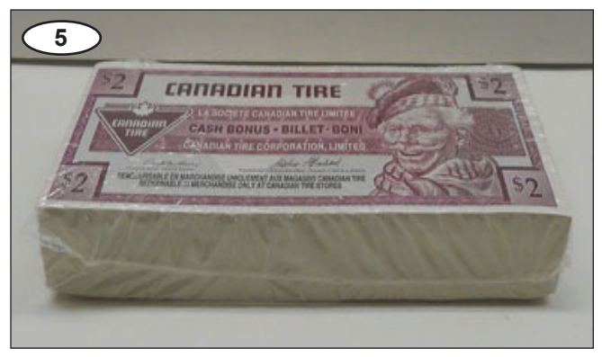
A bundle of CTC S22 $2.00 notes.