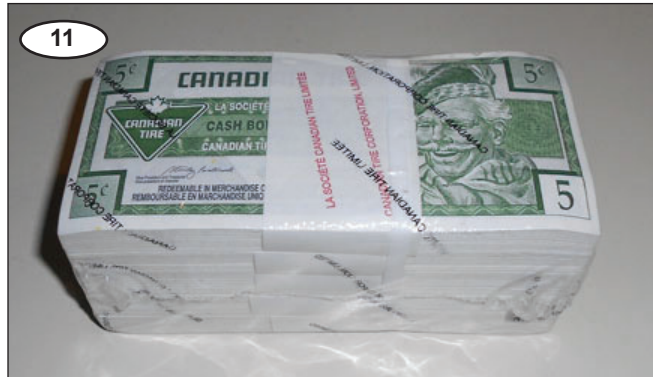
The same bundle of CTC S26 5^{\circ} notes showing the red printing on the white bands.