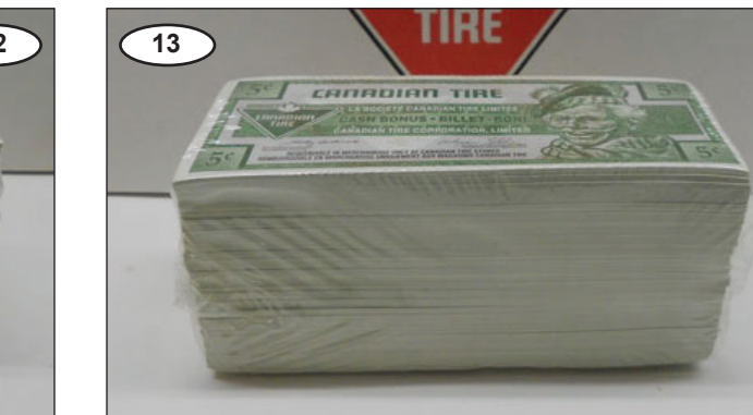
A bundle of CTC S27 5¢ notes with no white bands.