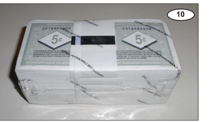
A bundle of CTC S26 5¢ notes.