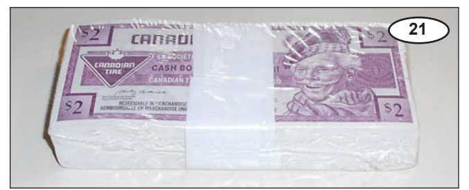
A bundle of CTC S28 $2.00 notes with the white bands.