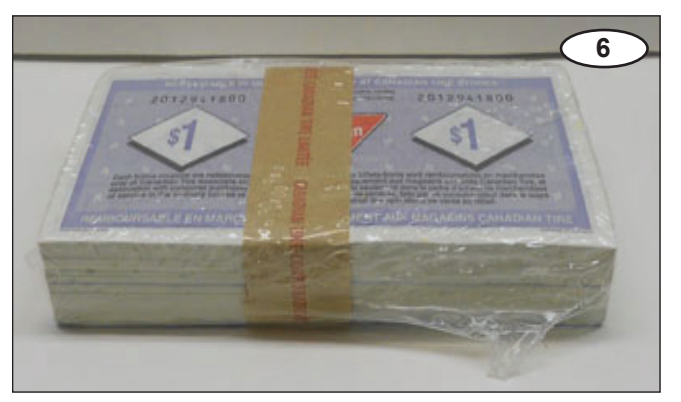
A bundle of CTC S20 $1.00 notes from the second printing.