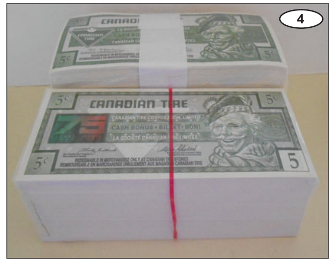
A bundle of CTC S18 5¢ notes next to a bundle of CTC S31 5¢ notes. Notice the height difference. Both bundles have 500 notes but the paper used for the S18's is thinner than that used for the S31's

The black and white pictures included with Peter Wiedemann's article from Volume 9 No. 3 in 1999 showing the bundles, the actual notes that match the wrapper label on the cardboard box and the CBN logo.